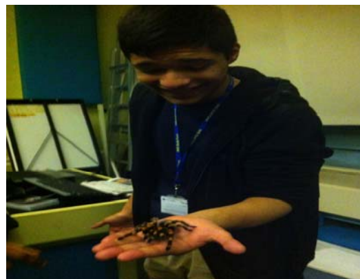
Cured after Hypnotherapy session!