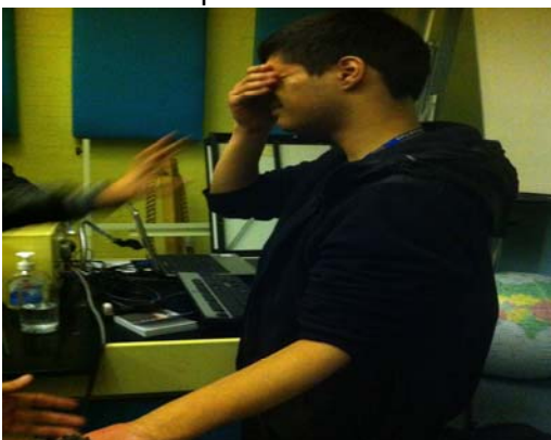
Before Hypnotherapy session

Psychology students were treated to a wonderful experience during their trip to London Zoo. Our students got to experience a first-hand group therapy session with a qualified clinical hypnotherapist. He firstly delivered a session on treatments of phobias and the learners then session experienced a hypnotherapy session which was aimed at curing anyone of a phobia of spiders. We were introduced to a real life tarantula when many students had the privilege to hold in the palm of their hands!